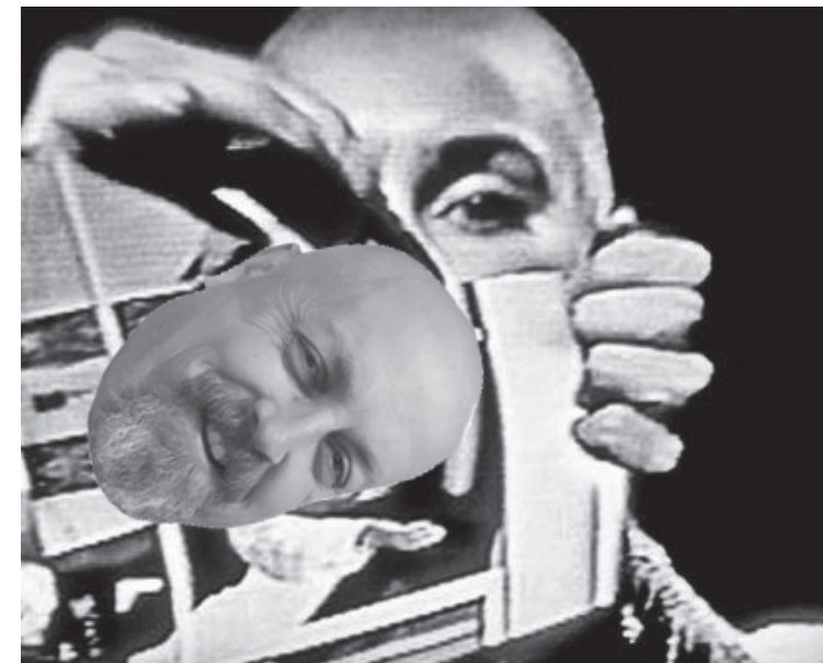
SNL TARGET OF SINEAD O'CONNOR?